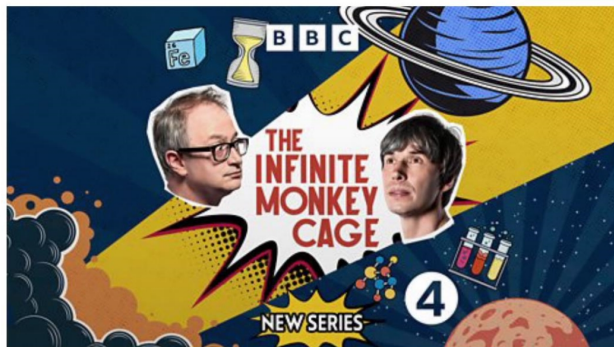
Talking trees with Dame Judi Dench