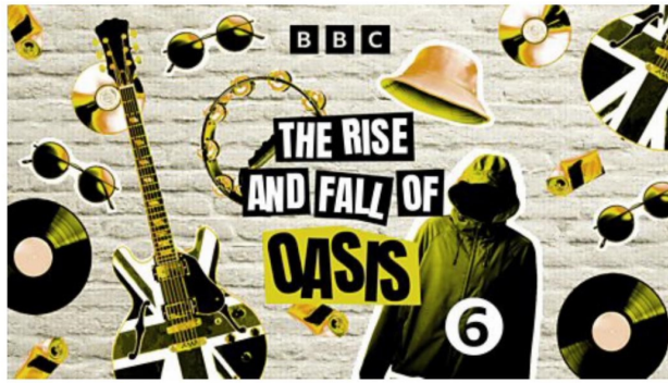
Oasis-mania with Whiley and Lamacq