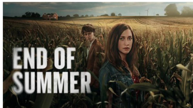
A mystery drama unfolds in Sweden