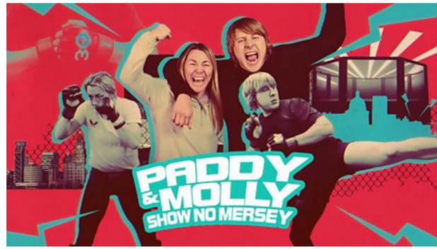
Blood, sweat and tears in Liverpool