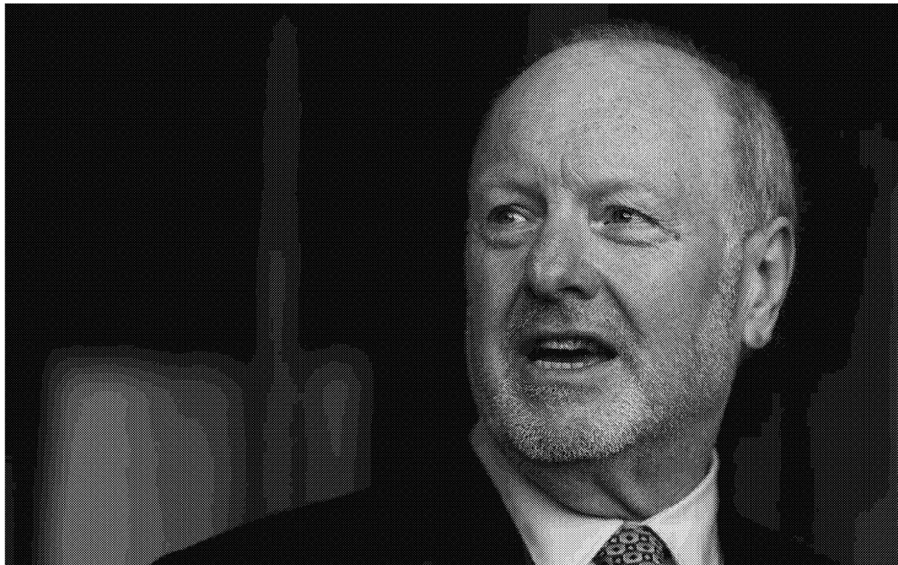
Mr Staunton was fired by Ms Badenoch as the Post Office's chairman in January