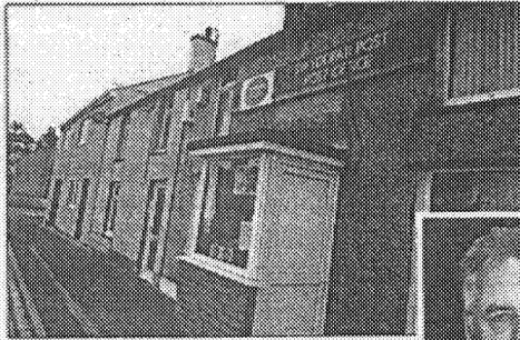
Post office Gaellween post office is set to reopen this week.